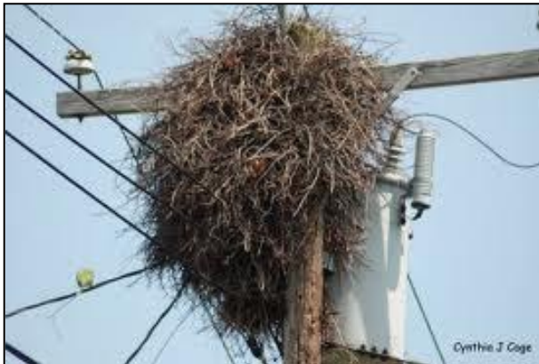
Monk parakeet nests on electric utility poles in the USA.